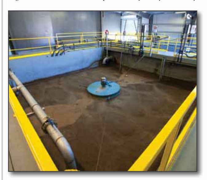
One of Quechan Casino's batch biological reactors.

Quechan Casino Resort, a newly constructed gaming facility located on Native American owned land in Winterhaven, California, began its wastewater treatment operations in January 2009. Early into the project development, it was decided that the