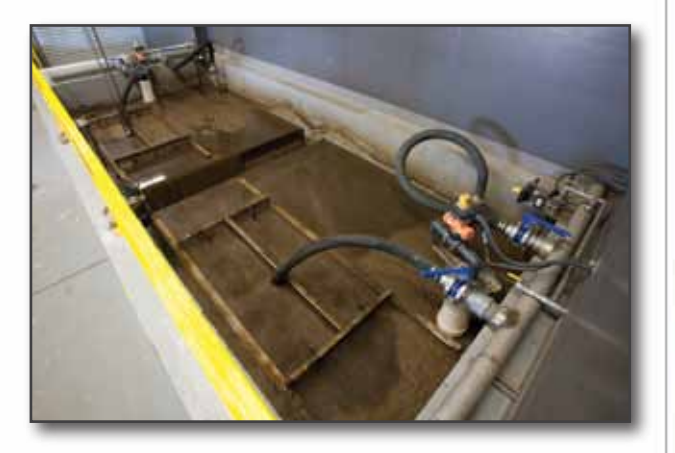
Quechan Casino's membrane module in air scour mode.

The system was actually started up a month before the casino opened in order to get the biomass to necessary levels for treatment of the Grand Opening flows. The flow was expected to go from < 2% to nearly 100% capacity in one day! Because of Aqua-Aerobic Systems' unique, early startup plan, Quechan Casino avoided the large expense of hauling seed-sludge.