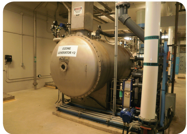
One of the Ozone Generators at the Burlington Plant

Right at the outset of the 21st century, the Regional Municipality of Halton began investigating alternatives to their disinfection program, which relied on chlorination as the backbone of the process. While drinking water chlorination has enjoyed more than a century of effective use, studies over the last few decades have found that disinfection byproducts like trihalomethane (THM) and haloacetic acids (HAA) present a significant threat to human health. Combined with the ineffectiveness of chlorination on taste and odor concerns and the Municipality’s desire to establish a voluntary standard for reduction of the Cryptosporidium protozoa, one of the treatment alternatives that the Municipality investigated in 2000-2001 was ozonation.