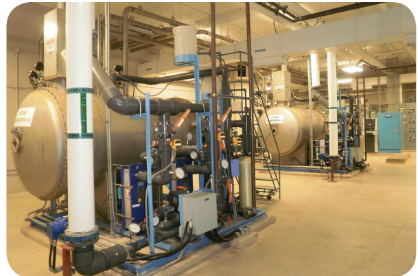
Multiple Ozone Generators at the Burlington Plant (550/kg/day)

The ozone treatment system was able to eliminate foul tastes and odors brought on by the algae blooms, resulting in a 50% reduction in the number of complaints to the Municipality about the taste of the water. The flocculation and separation of particulate matter earlier in the treatment process reduced the load on the plant filtration systems, nearly doubling the runtimes of the filters between backwashing. Disinfection byproducts such as THMs and HAAs were reduced by 30-40% on average, due to precursor elimination by way of ozone oxidation.