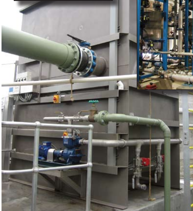
Figure 2. St. Helens WWTP Multiple-Barrier Treatment Process*

* Consists of a 2-basin sequencing batch reactor, cloth media disk filter, and external membranes.